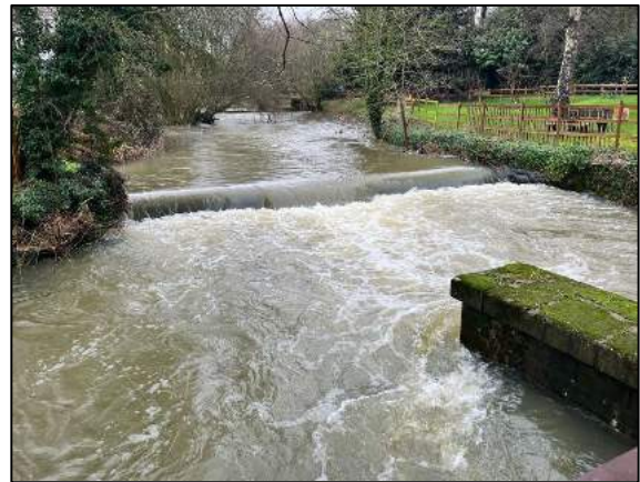
The Blackwater in full flow at the Museum of Power.