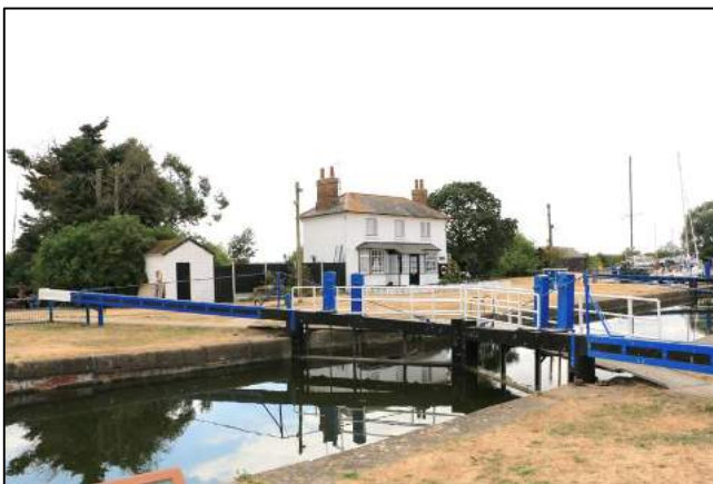
Sea lock to Blackwater Estuary at Heybridge Basin

The 'navigation' runs from an area south-east of Chelmsford called Masons Cross at the confluence of the Blackwater and Chelmer rivers, which go off in different directions. It runs to the north of Maldon coming out onto the Blackwater estuary at Heybridge Basin.