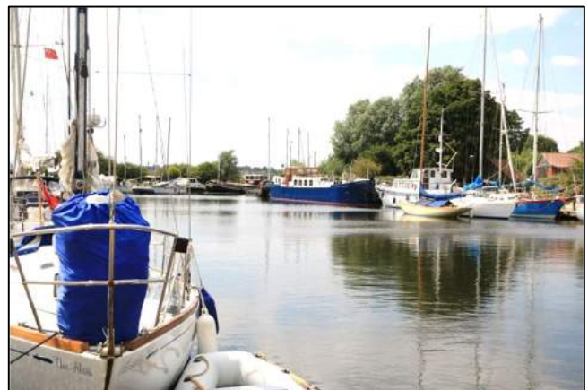
Chelmer and Blackwater Navigation