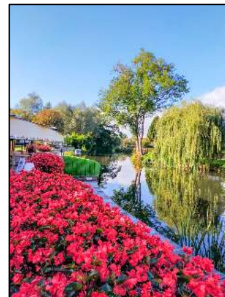
River Stour from the Talbooth on Essex side!