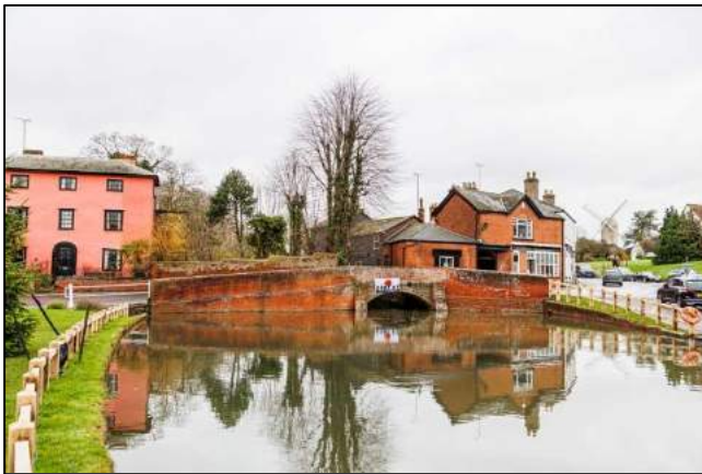
River Pant at Finchingfield. Also known as the Finchingfield Brook

The Blackwater also meanders through Essex passing by the Museum of Power. This used to pump water from the Blackwater into the Hanningfield Reservoir but that is now transferred to a more modern pumping station about ½ mile away.