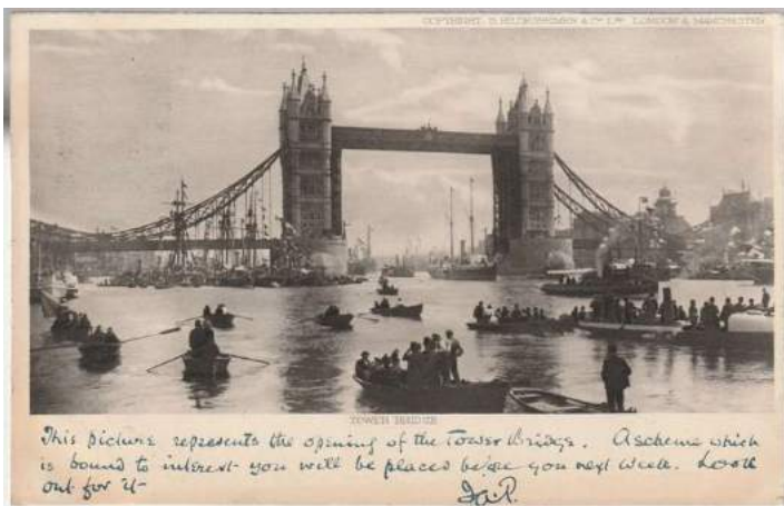
Postcard of official opening of Tower Bridge 30 June 1894 by HRH Edward, Prince of Wales.

River Thames and Tower Bridge - Yesterday and Today: