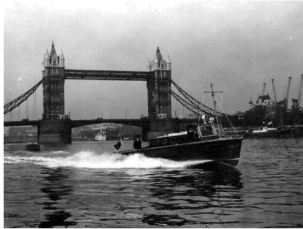
The Thames River Police in action in the early 1960's.

There is a small museum located at Wapping police station, which for more than two centuries has been the headquarters of the River Police. The museum is housed in the old carpenters workshop and is administered by the Thames Police Association.