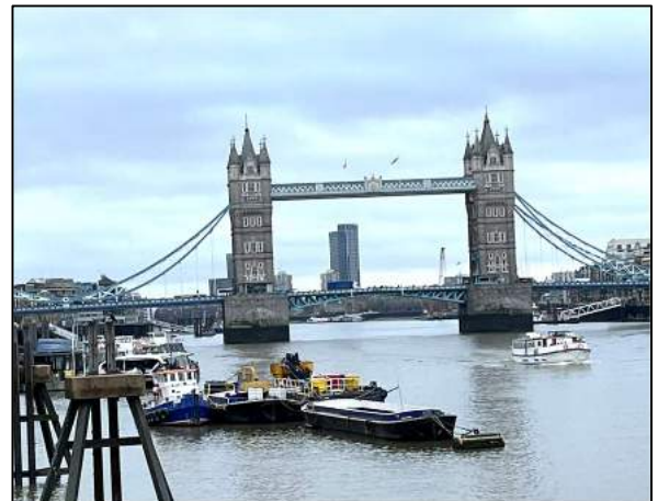
Tower Bridge and river scene NOW.