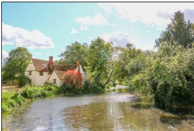
River Stour at Haywain crossing NOW. Flatford Mill, Dedham